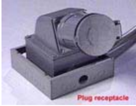
SHORE POWER FROM FACILITY