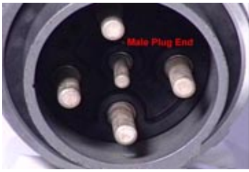
FROM DBRS MOBILE